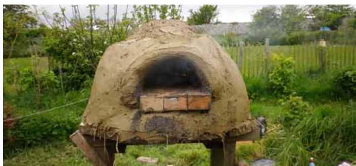
Above are ideas of what our community garden and clay oven could look like.