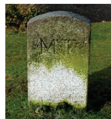
Two of the marker stones along the Parish boundary