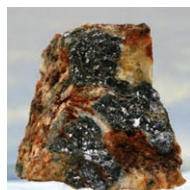
Galena from Wheal Betsy

Orientated north-south along the Cholwell valley, the lead lode exploited at Wheal Betsy