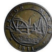
The Tavistock Penny, a token used to pay miners when coin of the realm was in short supply, and exchanged for goods in shops and pubs.

In 1869 the mine was sold again and it reverted to its original name of Wheal Betsy. The lode was worked on a reduced scale until 1877 when Wheal Betsy mine was finally closed.