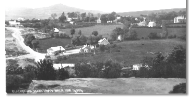
Can you see where your house would be? (to help with oriendtation, Brentor church is in the background and the reading Room just left of central),

If you would like to lead a walk in the area please contact the Jubilee Group.