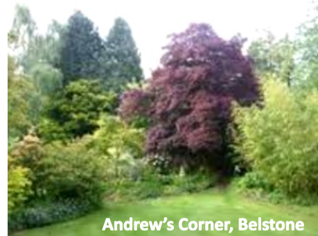
Andrew's Corner, Belstone