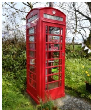
The Scone Box, a lovely little cake shop at EwORTHY near Germansweek.

The phone kiosk near the Church is a listed building, a K2 kiosk designed by Giles Gilbert Scott in the 1920s; although listed it is nevertheless possible the telephone could be removed from the kiosk, but it is not mentioned on the BT consultation list.