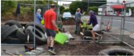
Some of the dozens of volunteers who created the original tyre planters and then moved them to their current site.

At the Country Show there will be a competition for the best tyre planter. Tyre No.7 is looking for a new 'owner'.