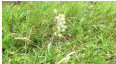
A pale orchid recently photographed amongst grass on a roadside bank in Mary Tavy

If the community would like to see wild verges perhaps the Jubilee Group could work with the Parish Council to make this happen.